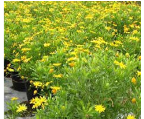
CALIFORNIA BUSH DAISY