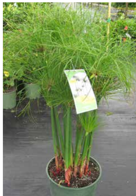
DWARF PAPYRUS LITTLE TUT