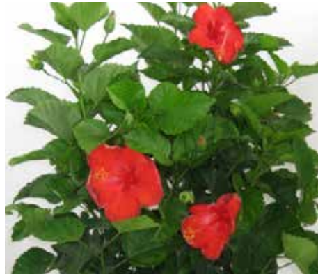
PRESIDENT RED HIBISCUS