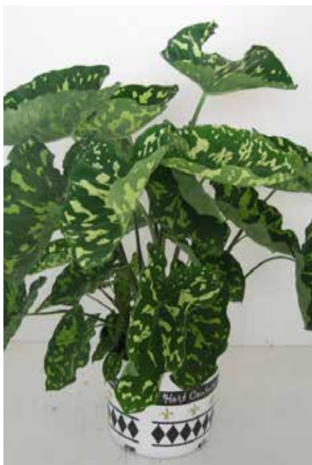
ALOCASIA HILO BEAUTY