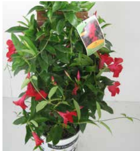
RED CRIMSON GIANT MANDEVILLA