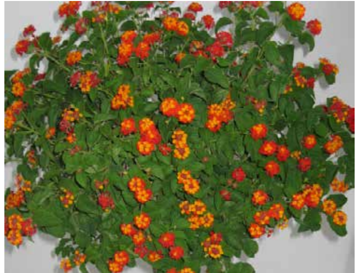
CONFETTI LANTANA TREE