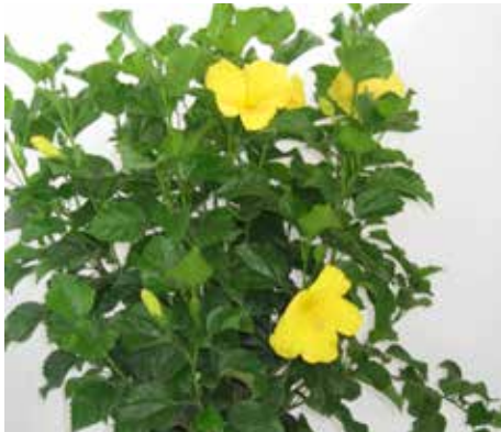
FORT MYERS YELLOW HIBISCUS