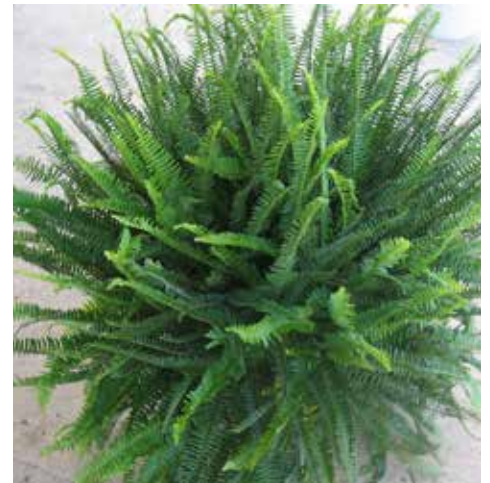
KIMBERLY QUEEN FERN