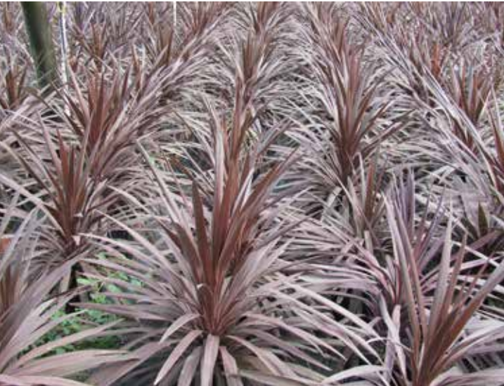
CORDYLINE RED SENSATIONS