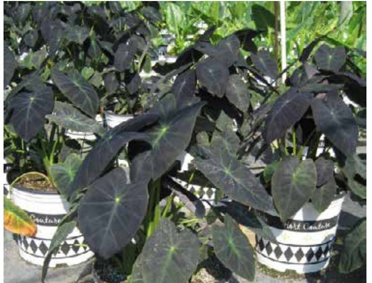
COLOCASIA BLACK BEAUTY