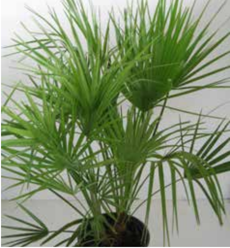
EUROPEAN FAN PALM