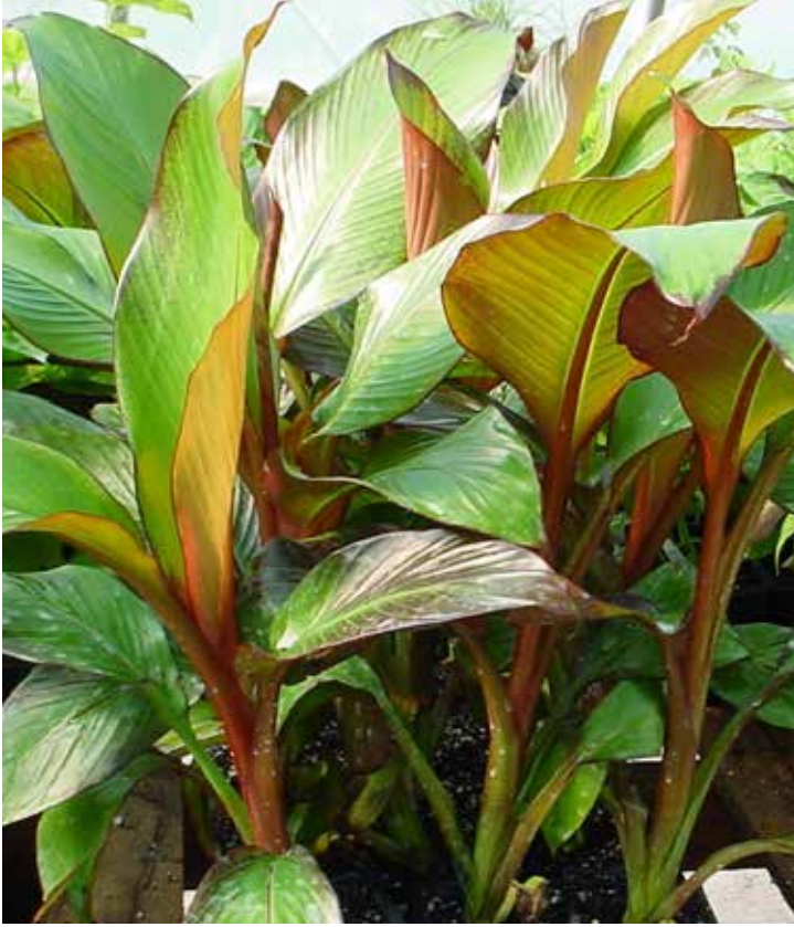
BANANA ENSETE MAURELII