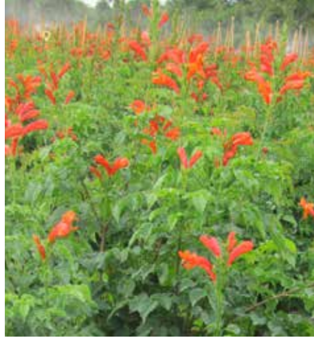
CAPE HONEYSUCKLE TRELLIS