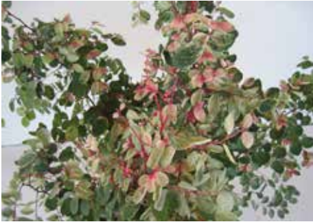
SNOW ON THE MOUNTAIN