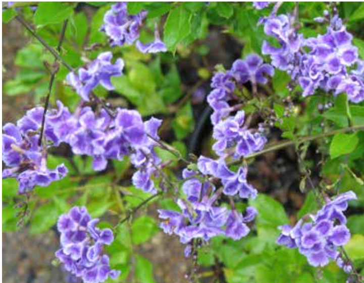
DURANTA SAPHIRE SHOWERS