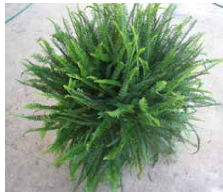
KIMBERLY QUEEN FERN