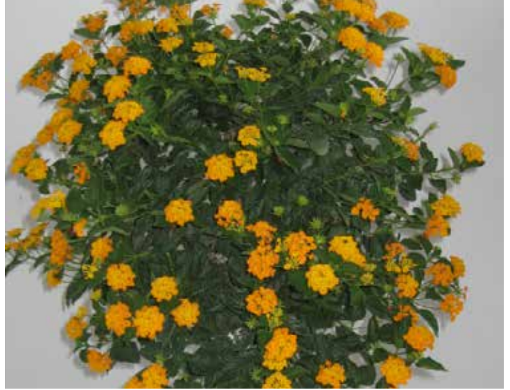
GOLD LANTANA TREE