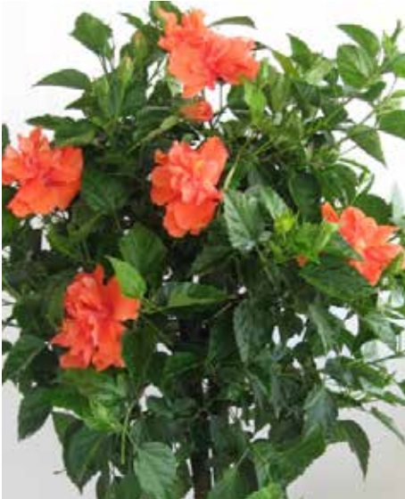
DOUBLE PEACH HIBISCUS STANDARD