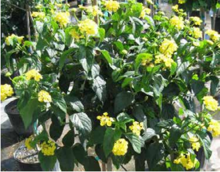
YELLOW LANTANA TREE