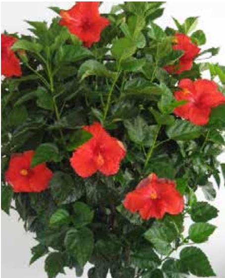
PRESIDENT RED HIBISCUS STANDARD