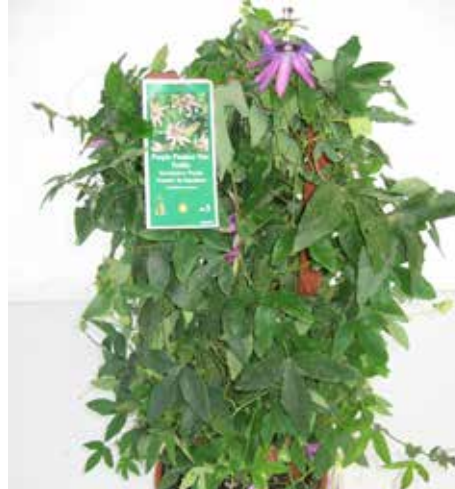
PURPLE PASSION VINE