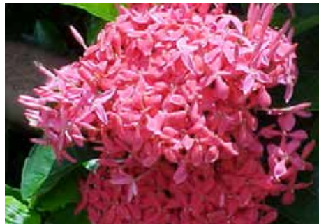
IXORA NORA GRANT