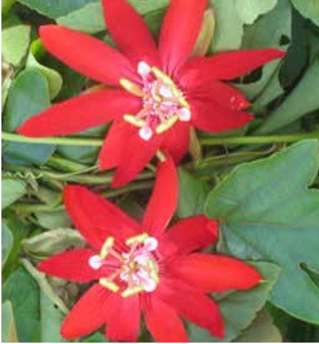
RED PASSION FLOWER