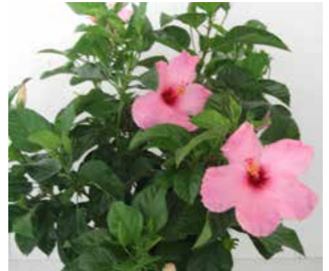
SEMINOLE PINK HIBISCUS