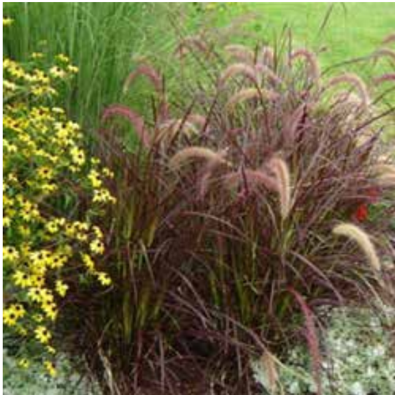
RED FOUNTAIN GRASS